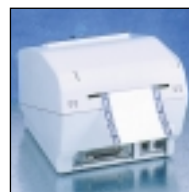
External Paper Feed Path