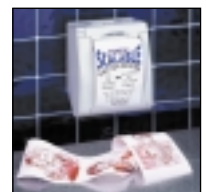
Wall Mount Option