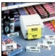
Shelf Edge Labelling